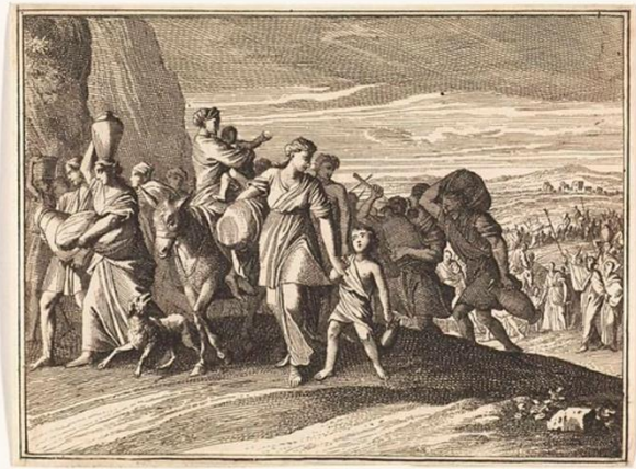
Exodus from Egypt. Origin: Amsterdam. Date: 1712. Caspar Luyken, print maker, Noord-Nederlands (1672–1708), Rijksmuseum, Public Domain Dedication.

reaching the end of the journey, gifted with a promised land – a good land long anticipated, a land flowing with milk and honey.